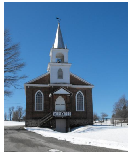
Front elevation of St. Andrew's - Congregation established in 1840 Church built in 1841-42 (Mar. 2012)