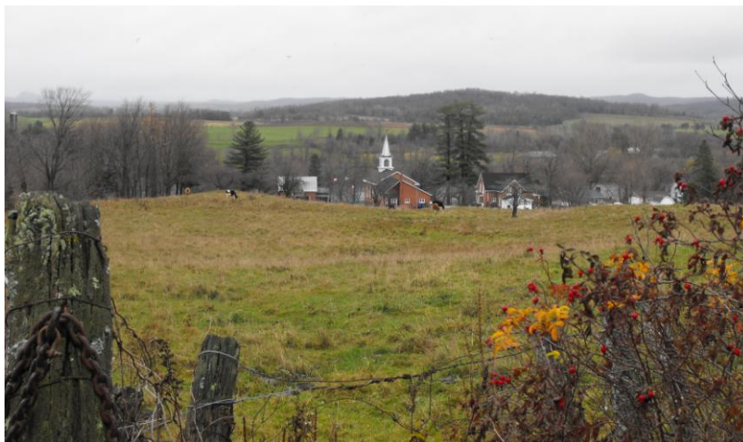
The same vantage point as the 1954 Canadian $2 Bill (Nov. 2012)